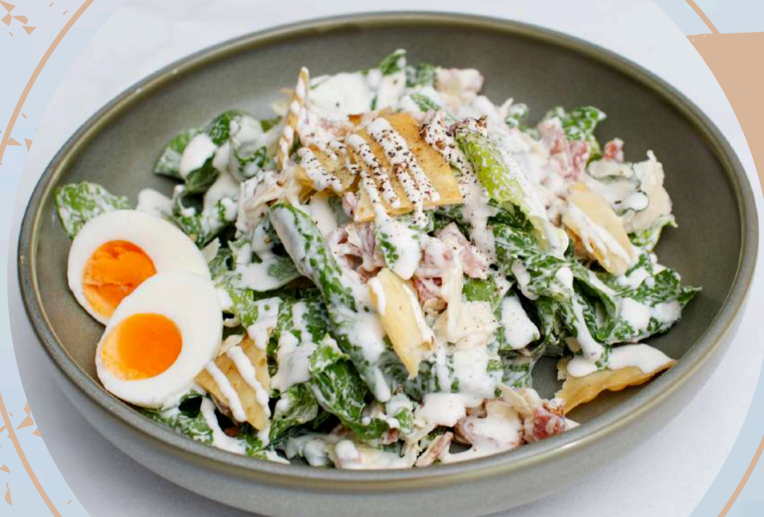
Classic Caesar Salad

add: smoked chicken, salt and pepper prawns, marinated tofu $8