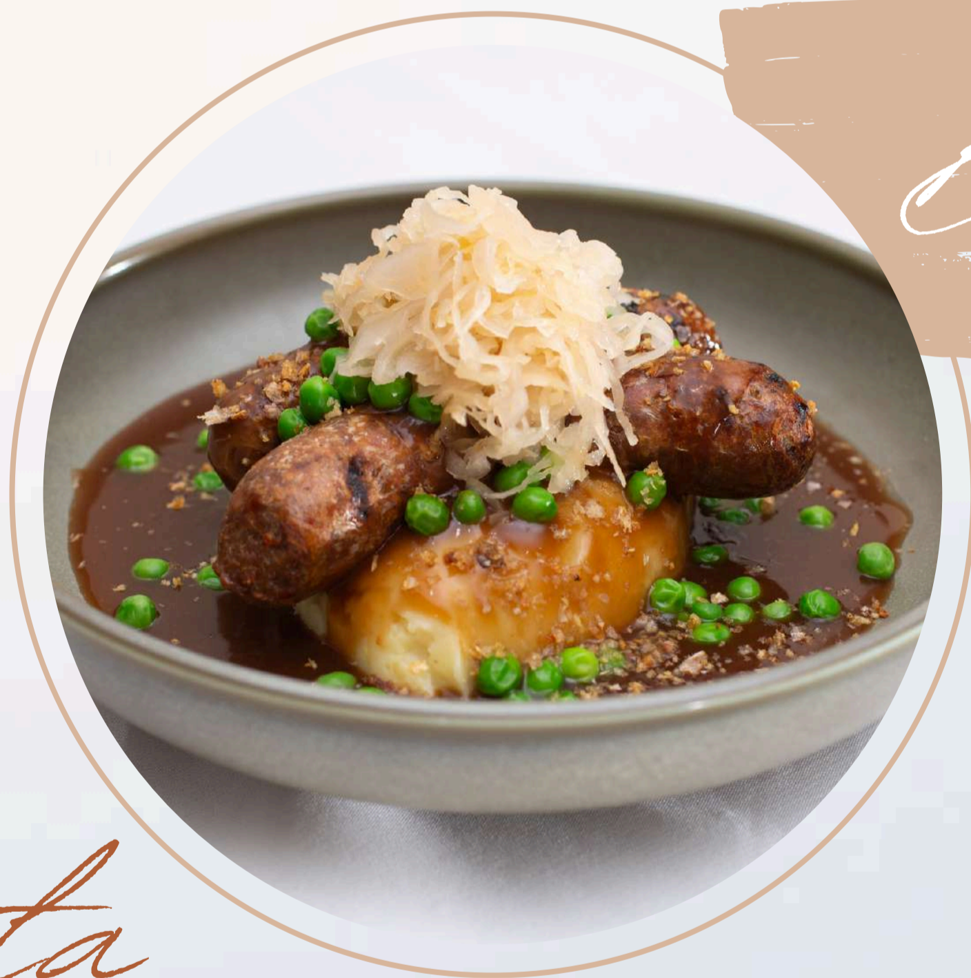
Beef and Onion Sausages